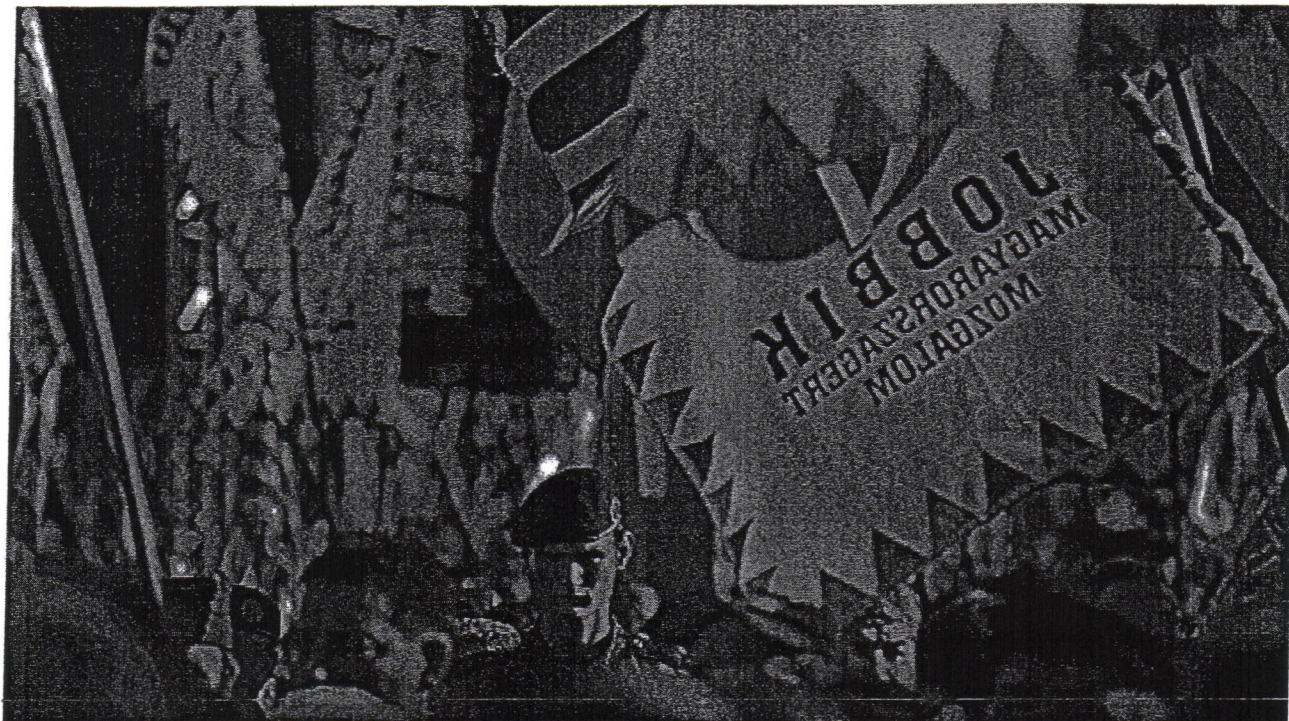
The rise of the right: Hungary's Jobbik party rallies supporters in Budapest.